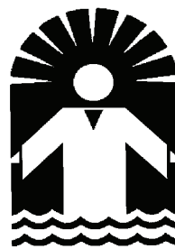
The Baptism of Our Lord

Parish Community Center: For rental or schedule information, call the parish office at 467-6509.